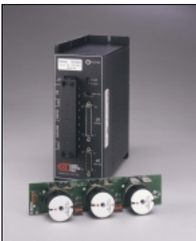
Image of the internal filter, taken out of the 7225ACF

This filter is designed specifically for the modular series amplifiers. The modular series includes: 5x24AC, 5x24DC, 7x25AC, 7x25DC, 7x26AC, 7x26DC, 7x29AC, and 7x29DC. Append the letter F to the model number, for the filter option. Example 5424ACF